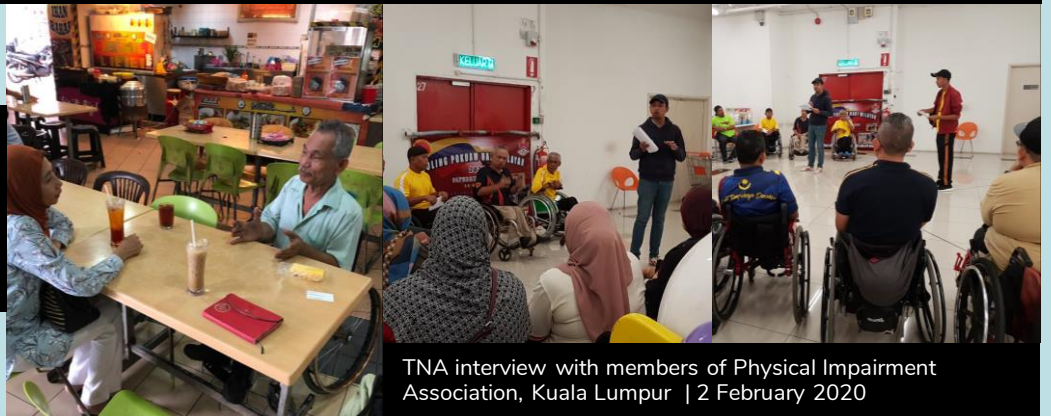
TNA interview with members of Physical Impairment Association, Kuala Lumpur | 2 February 2020

Key informant interview with President of Physical Impairment Association, Kuala Lumpur | 30 January 2020