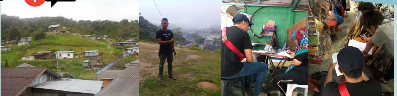
TNA interview with Orang Asli Sungai Ruil, Cameron Highlands, Pahang | 17 January 2020

Key informant interview with President of Physical Impairment Association, Kuala Lumpur | 30 January 2020